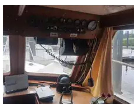
Scan the QR code or click the link in the footer to view more photos.

This information was provided to Pop Sells, LLC by the Seller and is believed to be accurate at the time of publication. We recommend an inspection by a qualified professional to ascertain the overall condition and function of structure and mechanical components.