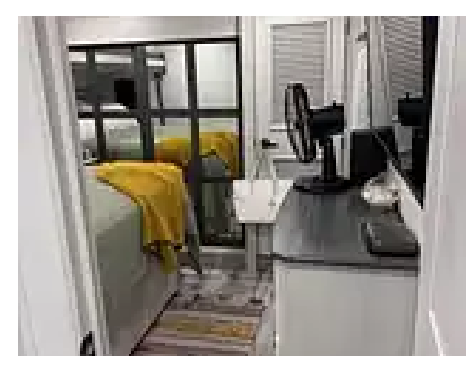
Scan the QR code or click the link in the footer to view more photos.

This information was provided to Pop Sells, LLC by the Seller and is believed to be accurate at the time of publication. We recommend an inspection by a qualified professional to ascertain the overall condition and function of structure and mechanical components.