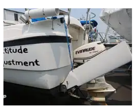
Scan the QR code or click the link in the footer to view more photos.

This information was provided to Pop Sells, LLC by the Seller and is believed to be accurate at the time of publication. We recommend an inspection by a qualified professional to ascertain the overall condition and function of structure and mechanical components.