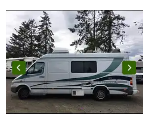
Scan the QR code or click the link in the footer to view more photos.

This information was provided to Pop Sells, LLC by the Seller and is believed to be accurate at the time of publication. We recommend an inspection by a qualified professional to ascertain the overall condition and function of structure and mechanical components.