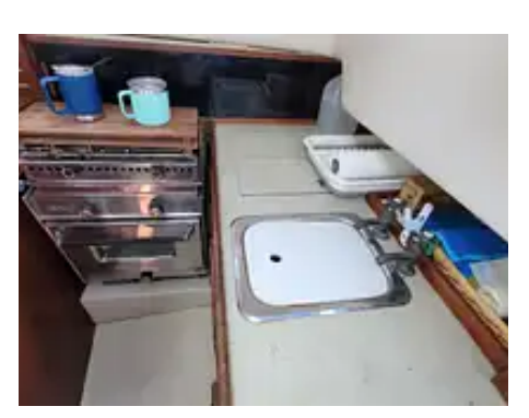
Scan the QR code or click the link in the footer to view more photos.

This information was provided to Pop Sells, LLC by the Seller and is believed to be accurate at the time of publication. We recommend an inspection by a qualified professional to ascertain the overall condition and function of structure and mechanical components.