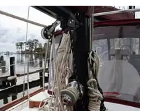
Scan the QR code or click the link in the footer to view more photos.

This information was provided to Pop Sells, LLC by the Seller and is believed to be accurate at the time of publication. We recommend an inspection by a qualified professional to ascertain the overall condition and function of structure and mechanical components.