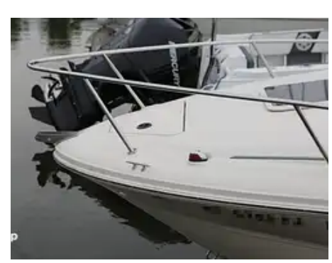
Scan the QR code or click the link in the footer to view more photos.

This information was provided to Pop Sells, LLC by the Seller and is believed to be accurate at the time of publication. We recommend an inspection by a qualified professional to ascertain the overall condition and function of structure and mechanical components.