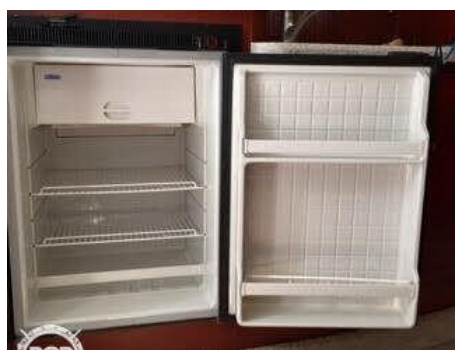
Scan the QR code or click the link in the footer to view more photos.

This information was provided to Pop Sells, LLC by the Seller and is believed to be accurate at the time of publication. We recommend an inspection by a qualified professional to ascertain the overall condition and function of structure and mechanical components.